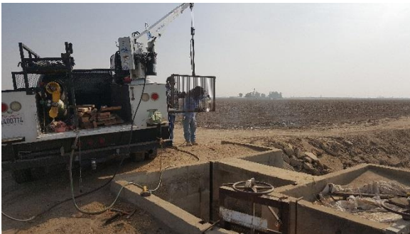
Repairs of District turnouts and screens.