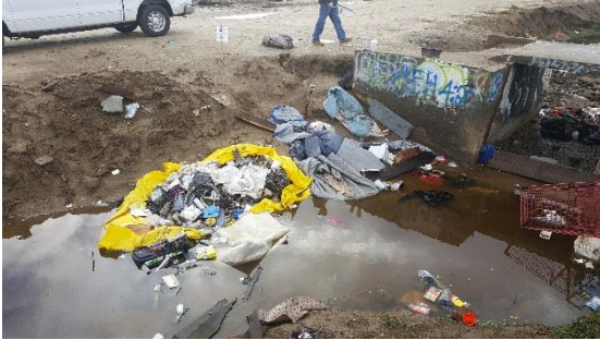
Removal of trash and debris from canals.