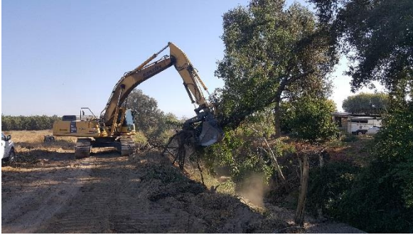
Removal of trees and debris on Crocker Cut.