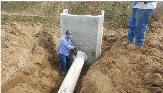
Installation of turnout per Landowners request.