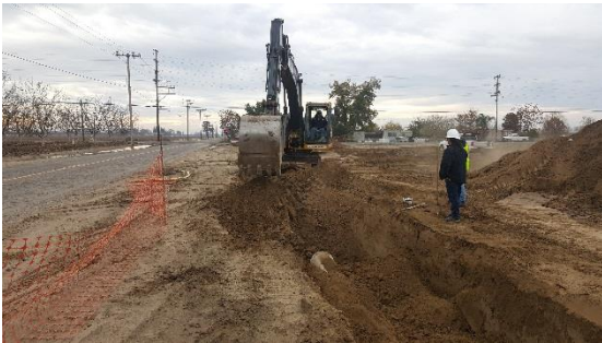
Installation of PVC pipe for Serpa East ditch.