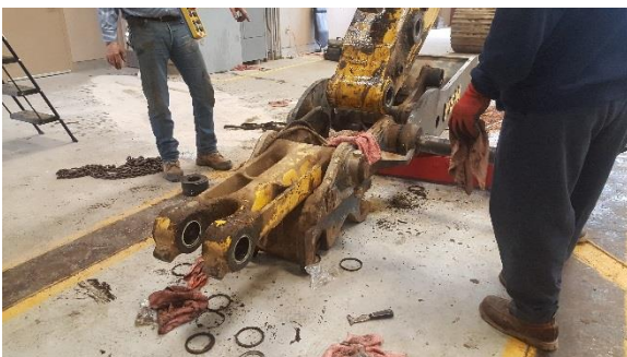
Shop employees removed the arm of Excavator for repair by A&E welding.