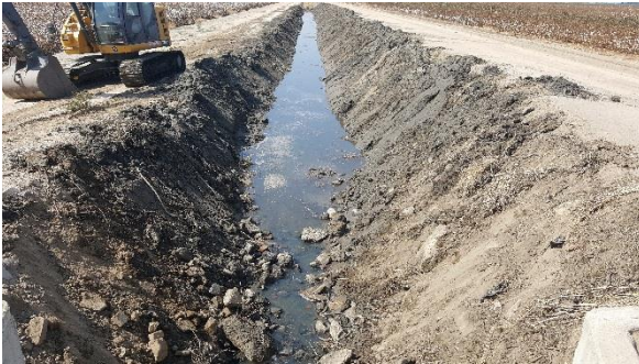
Removal of sedimentation from City pump ditch bottom