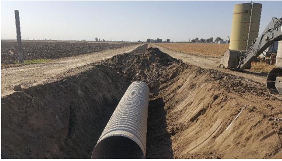
Replacement of coragated metal pipe with HDPE pipe on farmer ditch crossings.