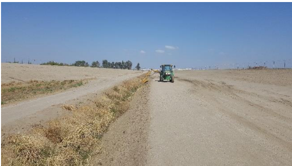
Mowing the canal slopes for grading operations.