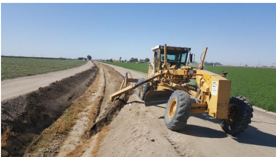
Grading of District canals and basins